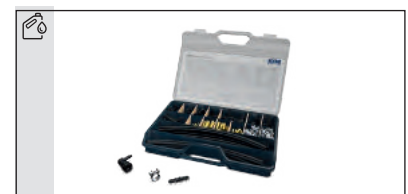
Fuel Line Repair Kit